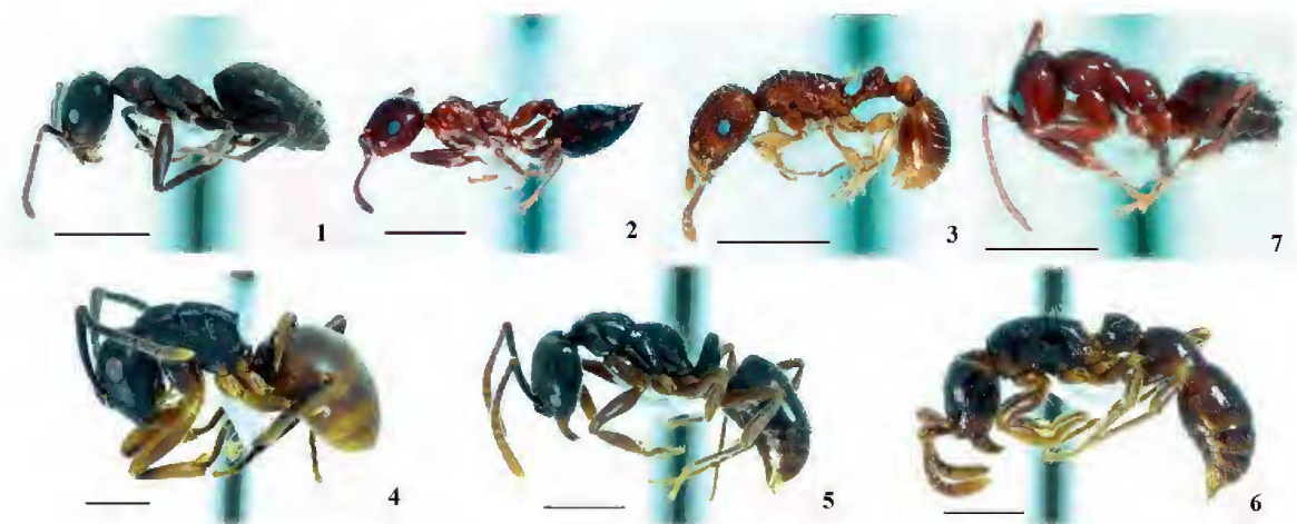
Figure 7: Ants: 1) Technomyrmex yamanei , 2) Crematogaster sp. 3, 3) Tetramorium cf. nipponense , 4) Polyrhachis halidayi , 5) Brachyponera cf. chinensis , 6) Cerapachys sulcinodis , 7) Nylanderia sp. 2. Scale = 1 mm. Identification and photo by Vladimir Zryanin.

*These species are readily identifiable by morphological characters on the level of local ant fauna and included in the recently published review (Zryanin, 2013) under indicated codes.